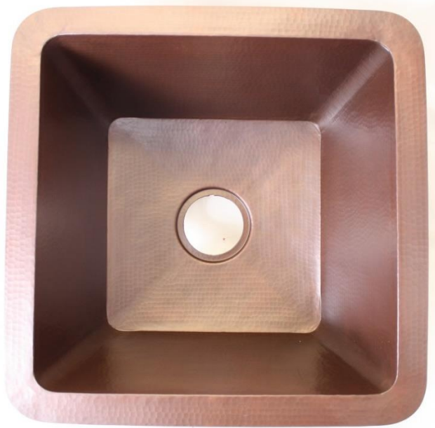
Shown in WC